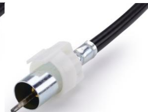
Ford Clip On Cable 130050-36