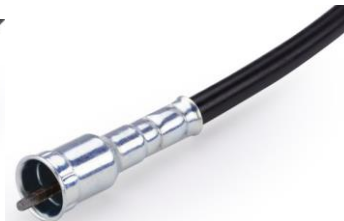
GM Clip On Cable 130049-36