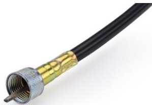
GM Thread On Cable 5/8" - 130048-36